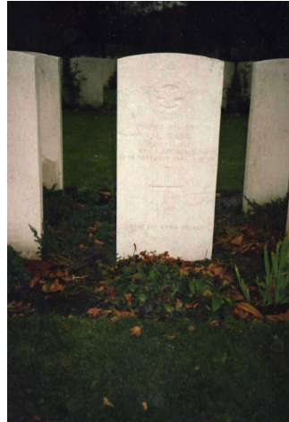
Grave at Berlin