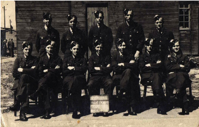
Third from left on front row