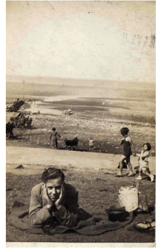
The same day?