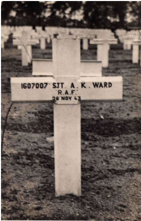
Grave at Getlow