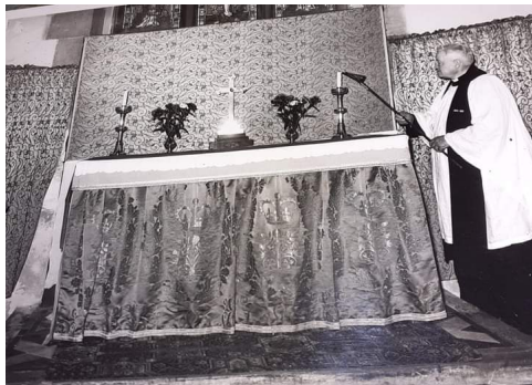
The altar frontal - even in black and white, the splendour of the fabric can be admired