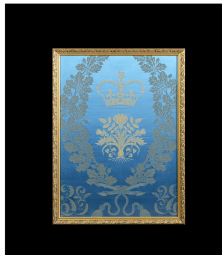
A small sample of the fabric showing the colours

It was woven in blue, with gold lurex thread, it features a gold woven crown above a rose, thistle, leek and shamrock emblem within an oak leaf wreath on a pale blue ground.