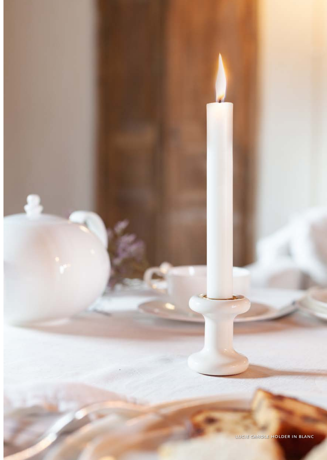
LUCIE CANDLE HOLDER IN BLANC

Lucie is inspired by the classic hourglass shape, while LouLou's elegant silhouette draws inspiration from the soothing ripples of the ocean.