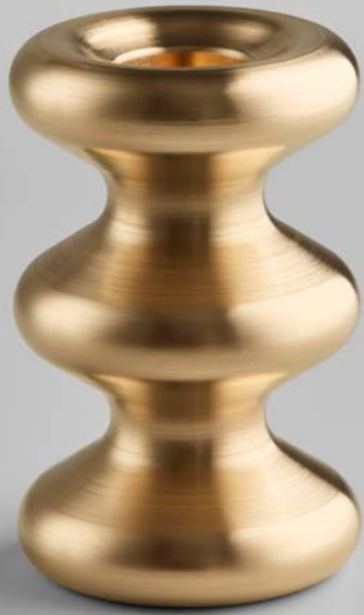
LOULOU CANDLE HOLDER IN BRASS