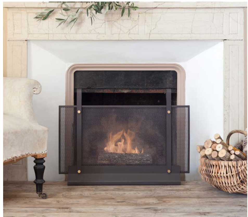
EMMA FIRE SCREEN IN CLASSIQUE

A fireplace isn't always lit, so Emma Olbers designed a screen that is beautiful to look at, with or without a fire flickering behind it. The screen adds charm to a room with its elegant curves and very Scandinavian design expression.