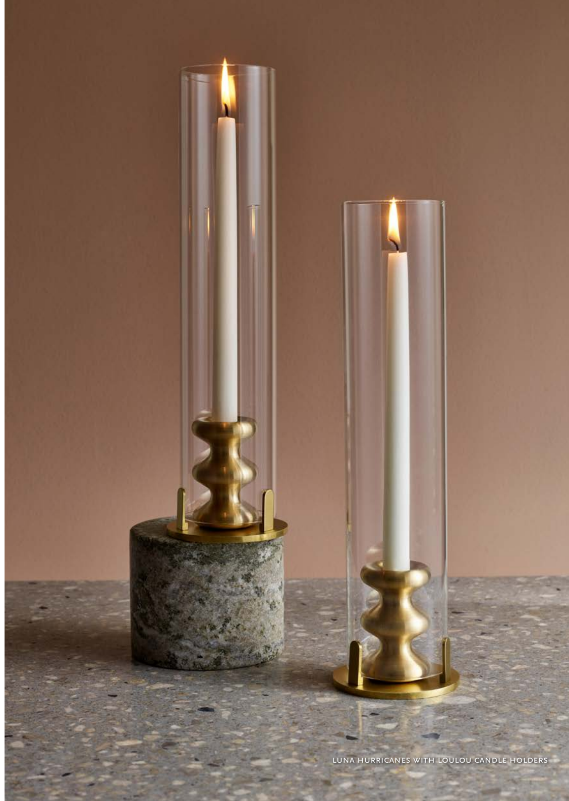
LUNA HURRICANES WITH LOULOU CANDLE HOLDERS