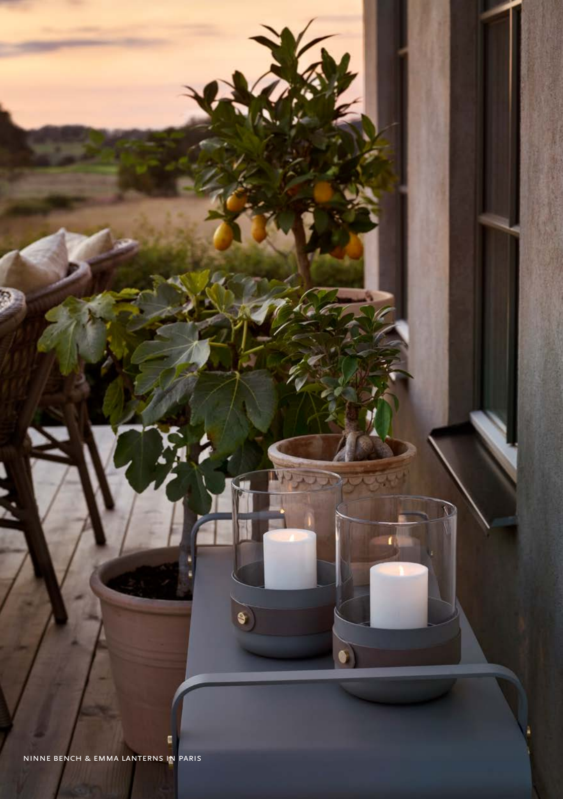
NINNE BENCH & EMMA LANTERNS IN PARIS