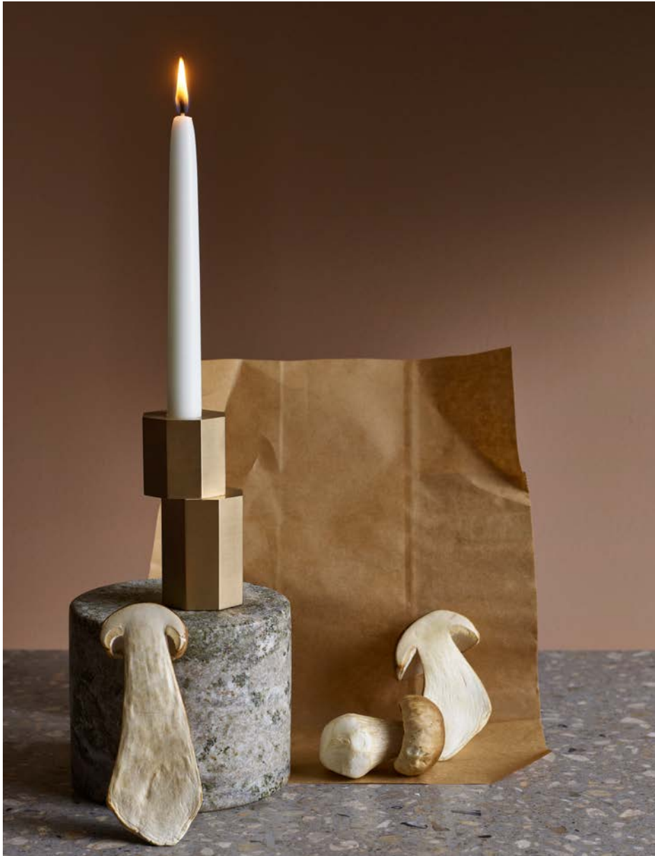
LUCA CANDLE HOLDER IN SOLID BRASS