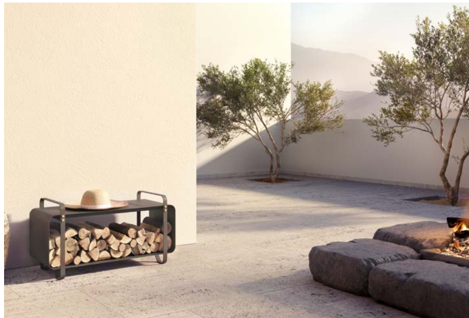
NINNE BENCH IN CLASSIQUE