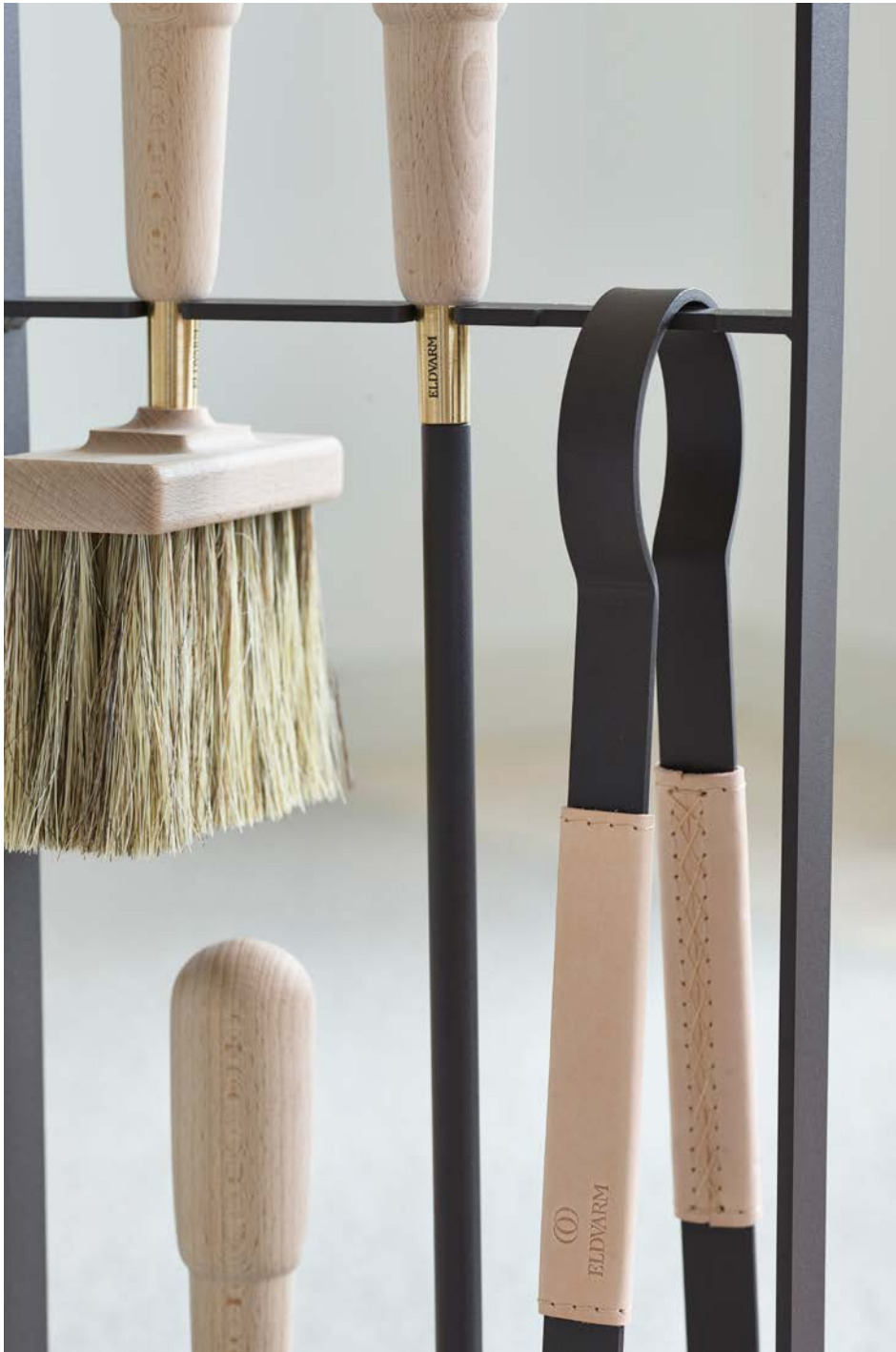
EMMA COMPANION SET AND BASKET IN NATUREL