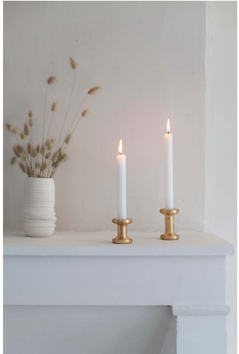
LUCIE CANDLE HOLDERS IN BRASS