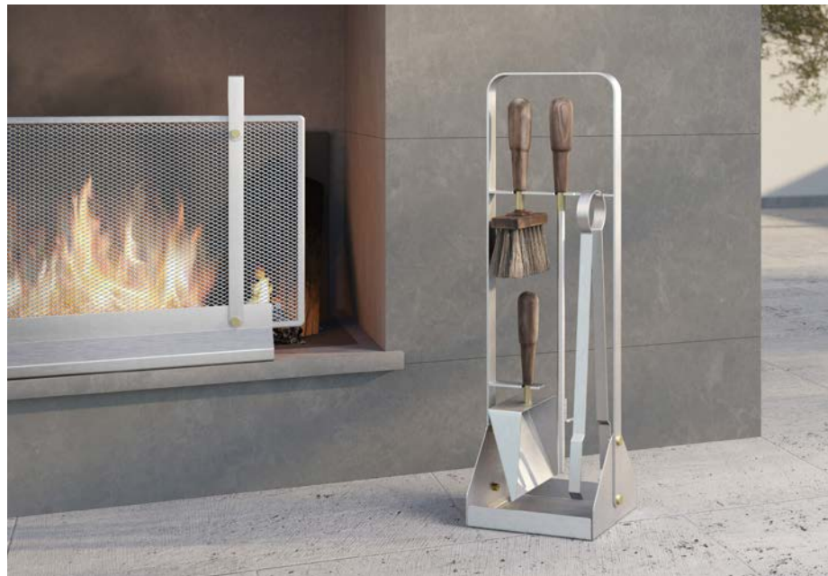
EMMA IN LUMIÈRE