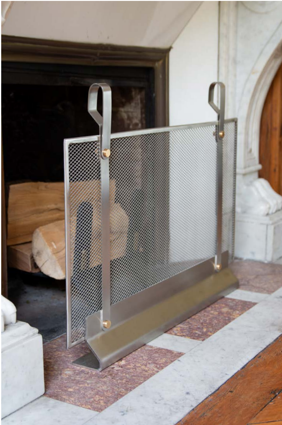
EMMA FIRE SCREEN IN LUMIÈRE