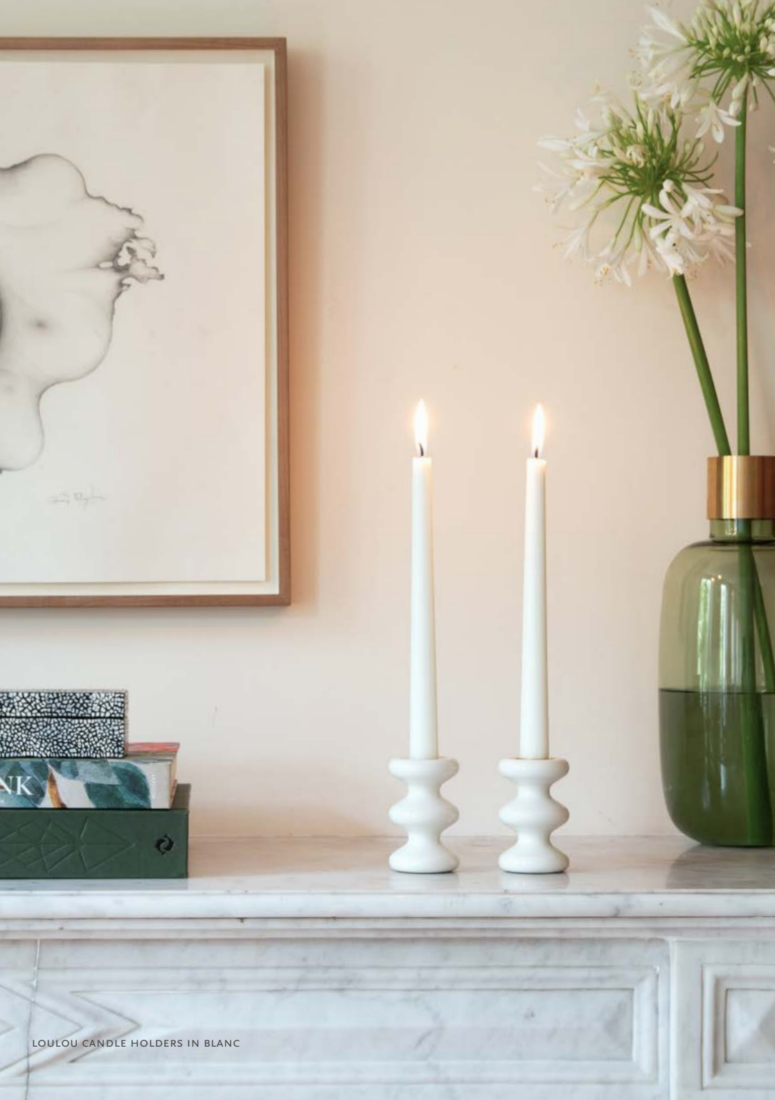
LOULOU CANDLE HOLDERS IN BLANC