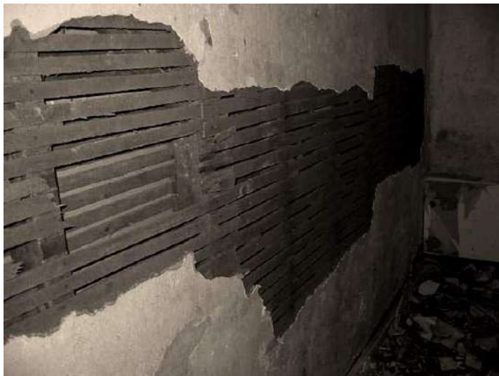
Between the walls Lath and plaster.