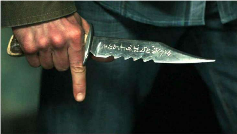
The Demon Killer Knife.