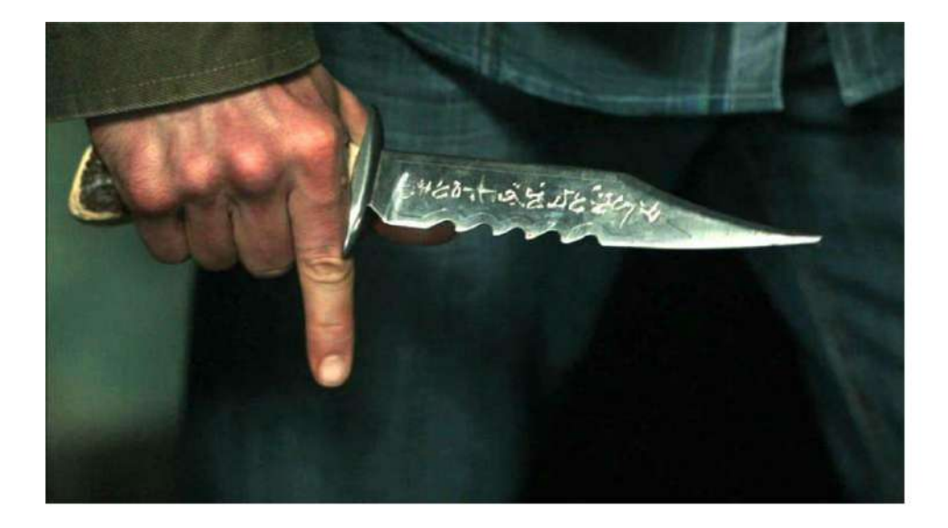
The Demon Killer Knife.