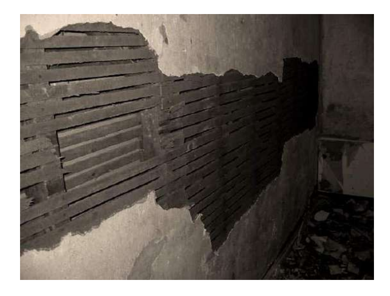
Between the walls Lath and plaster.