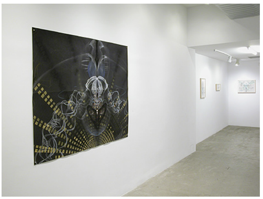
Installation view: Quantametronics 2015, graphite, gouache and conté crayon on paper, 58 x 65 inches

interconnectedness of the natural world. Spectral Bond, Light as Spiral leaves the viewer in awe, with the sense that the mysteries of the universe are not ours to fully know.