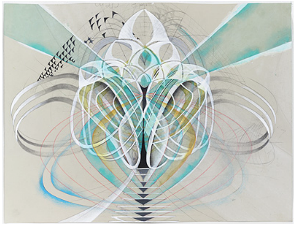
Light as Spiral, 2015, graphite, gouache, pastel and conté crayon on paper, 16 x 20 ^{1\!/4} inches