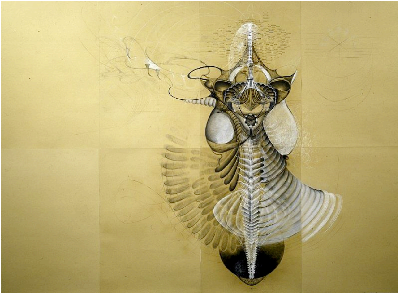
THE VIRTUAL UNDERGROUND, RED PHASE, 1999, 88" X 120"