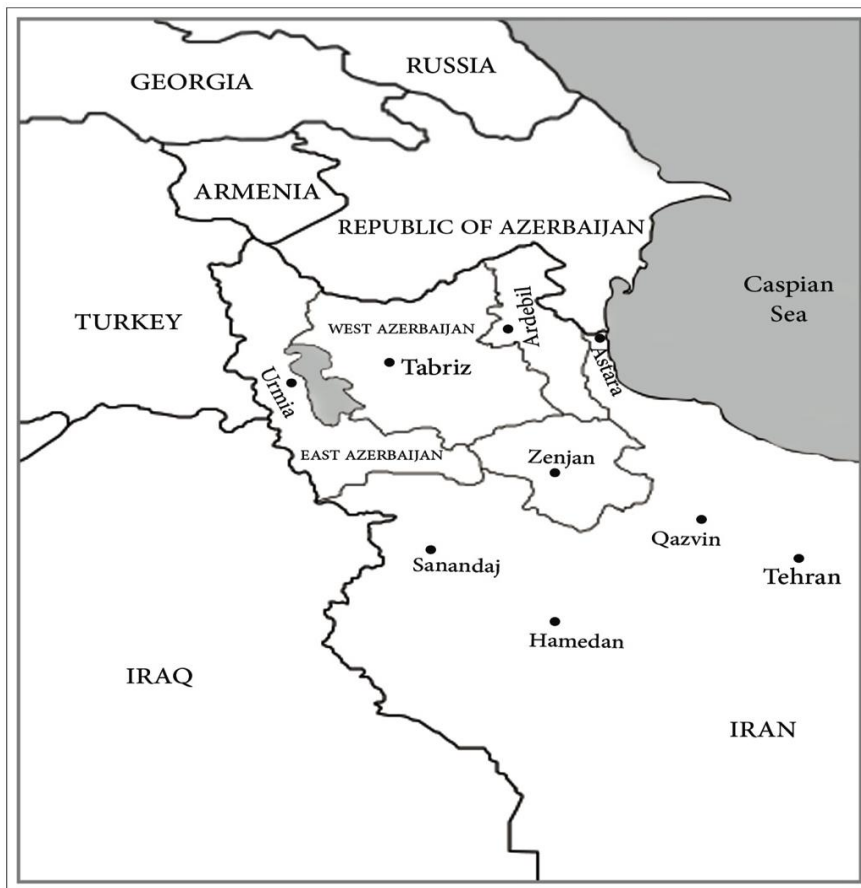
Figure 1. South Azerbaijan, Iran. Created by Sevil Suleymani.