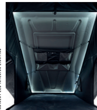
INDIRECT LED INTERIOR LIGHTING