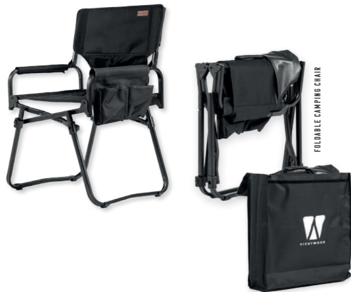
FOLDABLE CAMPING CHAIR