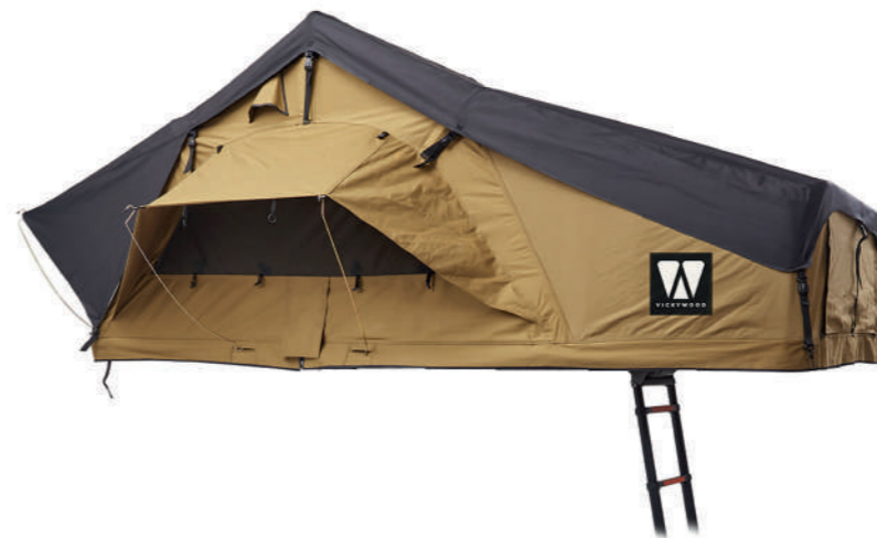
BIG WILLOW OPTIONAL WITH AWNING

Lying surface (L x W x H): 220 x 240 x 126 cm Weight: 100 kg Folded (L x W x H): 223 x 125 x 29 cm