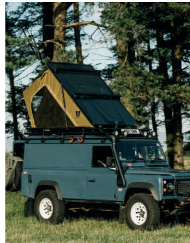
ALSO AVAILABLE IN EARTHY-YELLOW

Another highlight is the rack that can be mounted on top of the tent and supports weight of up to one hundred Kilos. By being adjustable seamlessly it allows you to transport boxes, bikes, boats or whatever else you need on your next adventure.