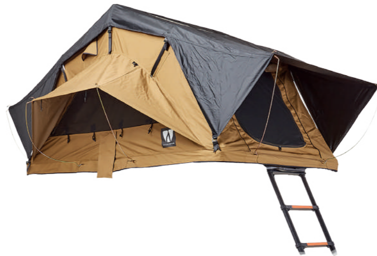
OUR COMPACT SMALL WILLOW