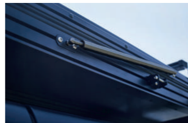
STABILUS GAS SPRINGS