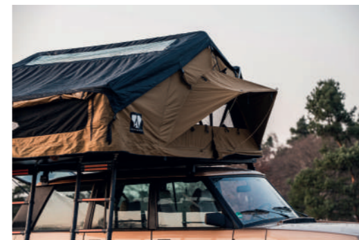
SPACE MIRACLE WITH GENEROUS WINDOWS