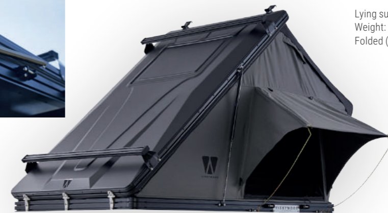
SLIDING ROOF RACKS | ROOFED ENTRY AND EXIT