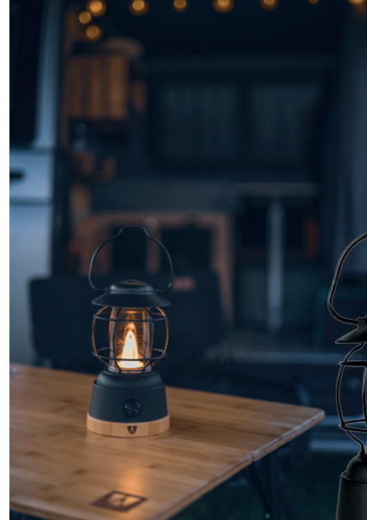
SMOOTH DIMMABLE CAMPING LIGHT