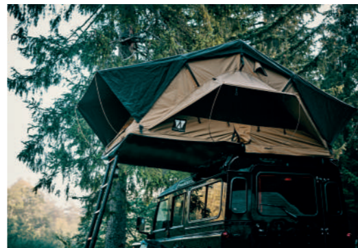
INCL. TWO SKYLINE WINDOWS