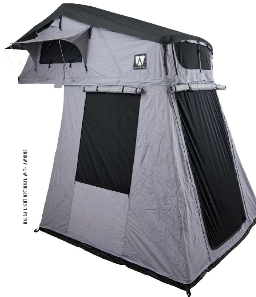
BALSA LIGHT OPTIONAL WITH AWNING