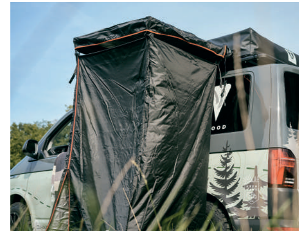
SHOWER TENT WITH REMOVABLE HOOD