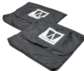
TWO SHOE BAGS