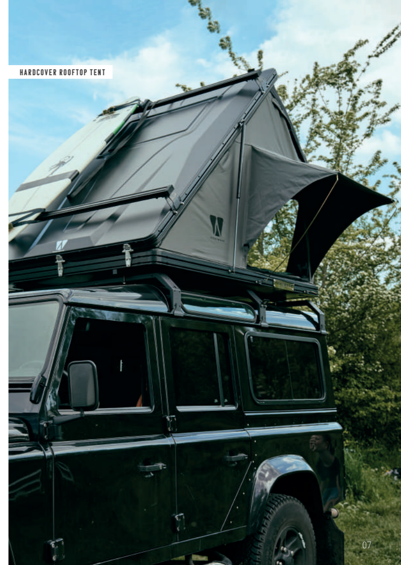
HARDCOVER ROOFTOP TENT