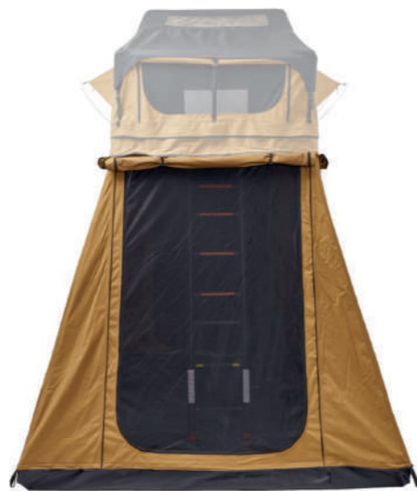
BIG WILLOW - THE LADDER IS INSIDE THE AWNING

Our awnings for the SMALL and BIG WILLOW tents are a versatile addition for every rooftop tent. They fit almost every height of vehicle thanks to the innovative zipp-system with which the height of the awning can be changed (165 - 180 cm or 200 - 220 cm).