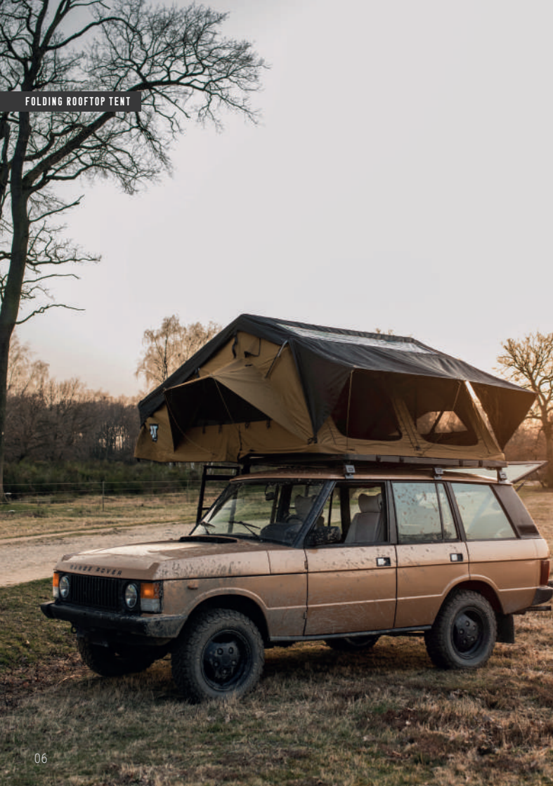
FOLDING ROOFTOP TENT