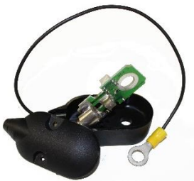
MP120RXT: Transformer connection box