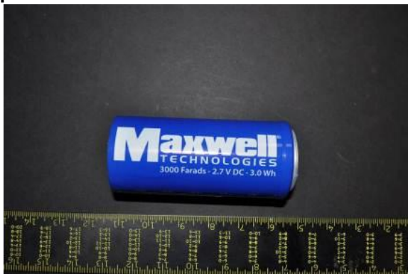
Test Article(s) A001