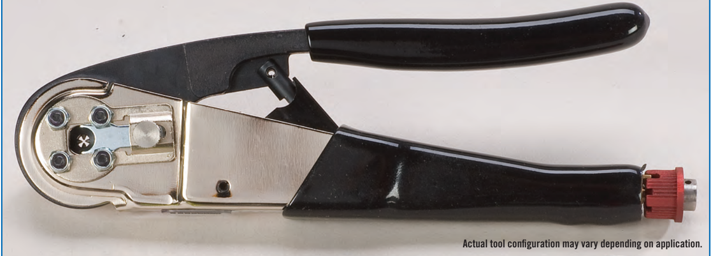
Actual tool configuration may vary depending on application.