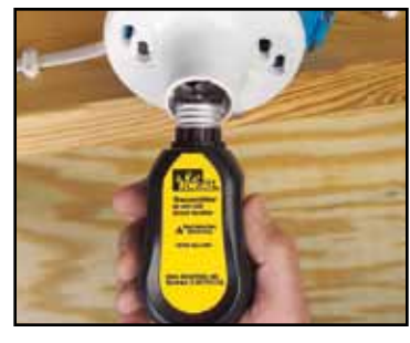
Lighting adapter allows connection to light fixtures.