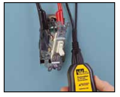
Alligator clip adapter allows connections to exposed wiring.