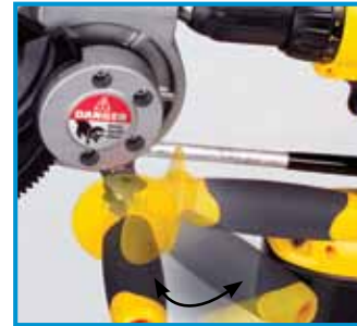
Folding handle for storage

Attaches to any cordless or corded drill (12V minimum)