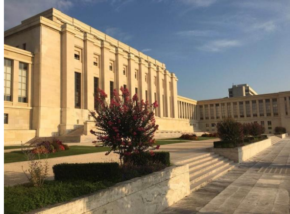
The 33 rd session of the HRC was held at the historic Palais Des Nations

Geneva, Switzerland – From 13 September to 30 September 2016, Americans for Democracy & Human Rights in Bahrain (ADHRB) participated in the 33rd Session of the United Nations Human Rights Council (HRC) to highlight human rights abuses in Bahrain, Saudi Arabia, and the rest of the Gulf Cooperation Council (GCC). ADHRB delivered 20 oral interventions and organized two side events. The testimony and dialogue provided during the convention was well received by UN officials, who joined ADHRB in criticizing the human rights practices of GCC countries, particularly Bahrain.