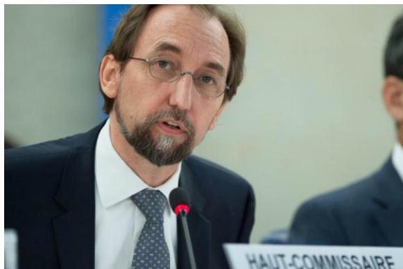
HC Zeid delivered his opening remarks at HRC33, specifically calling attention to situation in Bahrain

Prior to the start of the 33 rd session of the HRC, the Government of Bahrain renewed its wide-reaching repression of civil society. In line with the practice the government employed during the 32 nd session of the HRC, authorities issued a blanket travel ban on Bahraini activists preventing them from engaging with the Council.