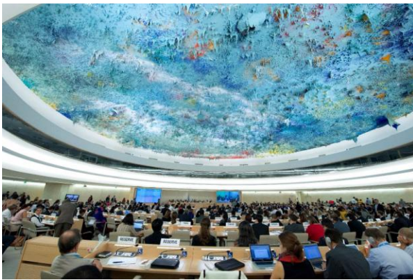
The 33 rd session of the Human Rights Council in Geneva, Switzerland.

On the same day, Yusuf al-Hurri delivered two interventions under agenda items 9 and 10. Under item 9, al-Hurri addressed issues of hate speech and religious discrimination in GCC states, including Saudi Arabia, Kuwait and the UAE. Under item 10, al-Hurri raised issues relating to Saudi Arabia's cooperation programs with OHCHR, in particular, that the kingdom's current cooperation agreement with the Office, conclude at the end of 2016, and called on Saudi Arabia to renew and expand its program to include civil society participation and transparency measures for accountability.