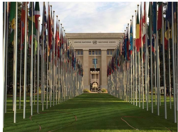
The Palais des Nations, at the United Nations in Geneva.