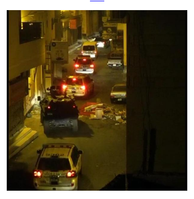
Arbitrary house raids and arrests in Karranah