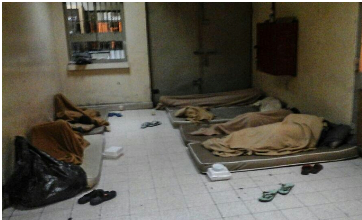
Inmates sleeping in corridors, Jau Prison.