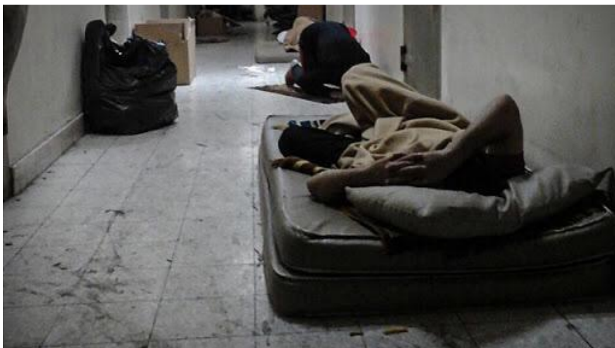
Inmates sleeping in prison corridors due to overcrowded cells. Jau Prison, Bahrain.

Jau Prison has been substantially overcrowded for at least two years. After his visit in 2013, the Ombudsman calculated the only official figures on the prison population. His office reported that the prison had a capacity of 1201 persons, but housed 1608, representing that Jau prison was approximately 34% over capacity by official numbers. At the time of Ombudsman's visit in 2013, Jau Prison was composed of seven housing buildings, a visitation centre, and several administrative buildings. Since 2013, three new buildings have been constructed to house inmates, for which no data exists. However, inmates