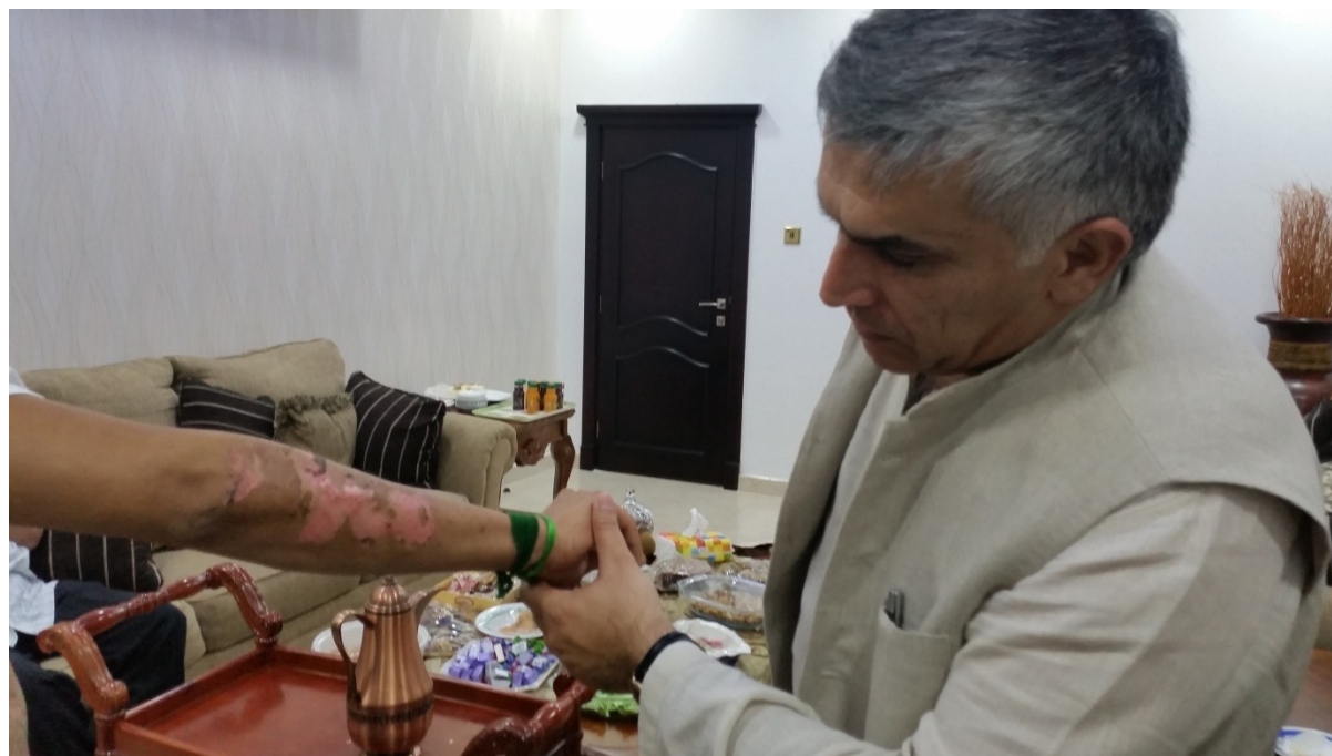
Nabeel Rajab, President of the Bahrain Center for Human Rights, examining the injuries of an ex-inmate recently released from Jau Prison, Bahrain.

In the weeks following the riot, police transferred over 100 inmates across the prison complex to Building 10, where police subjected them to sustained torture and ill-treatment. A large proportion of these inmates were peaceful activists who had protested against overcrowding in the weeks before the riot; the police now targeted these individuals for mistreatment on the suspicion that they instigated the disorder. They sectioned off these inmates and arbitrarily tortured them. Abdulhadi al-Khawaja, a human rights defender serving a life sentence in Jau Prison, wrote in a letter to the UN High Commissioner of Human Rights that "Building 10 has become known as the torture building."