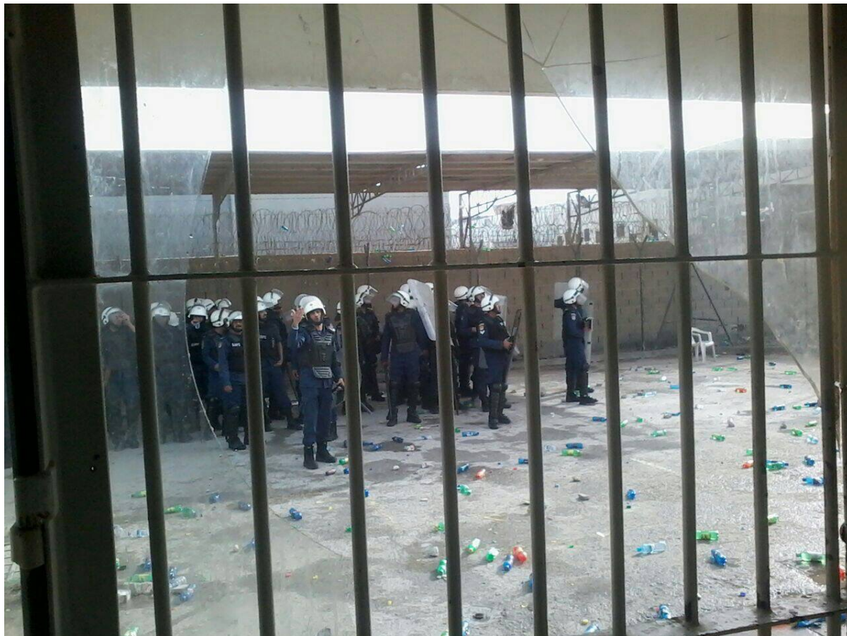
Riot police at Building 3 in Jau Prison, 10 March 2015, Bahrain.

The following chapter is based on interviews with victims of abuse at Jau Prison. In particular, it draws on the testimony of four men who were inmates at the time of the riot and who have since been released from prison. Their names have been changed to protect their identities. Abdulla was an inmate in Building 3. Fahmi and Tariq were located in Building 4. Mustafa was originally in Building 4 as well, but was later transferred to Building 10. Additional information is drawn from correspondence with inmates and relatives.