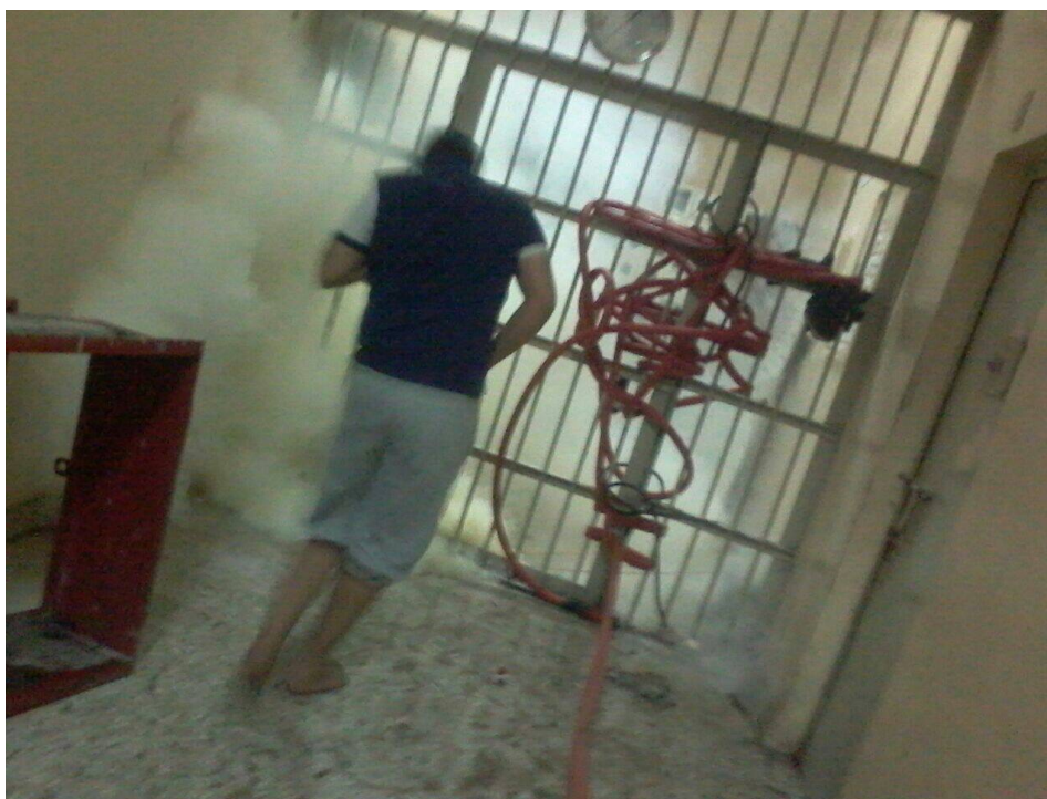
Tear gas fired into barricaded cells at Building 3. 10 March 2015, Jau Prison, Bahrain.

According to the Ministry of the Interior, the police established total control sometime after 7:00 P.M. 11 At this stage, security forces had completely subdued the inmates using excessive force and tear gas; they were all detained in the courtyard or in the lobbies of the prison buildings.