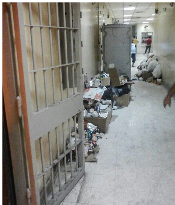
Filthy standards of living including dirty toilets and rubbish filled corridors. Jau Prison, Bahrain