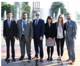
ADHRB and BIRD staff in front of the UN

That same day, ADHRB and the Bahrain Institute for Rights and Democracy (BIRD) presented an oral intervention during the general debate under Agenda Item 2 regarding annual reporting of the United Nations High Commissioner for Human Rights, Office of the High Commissioner, and the Secretary-General. ADHRB raised the cases of a number of human rights defenders, including Abdulhadi al-Khawaja, Abduljalil Singace, Mahdi Abu Dheeb and Ibrahim Sherif, among others.