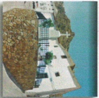
Refreshment stop Bar in Square, Cobdar