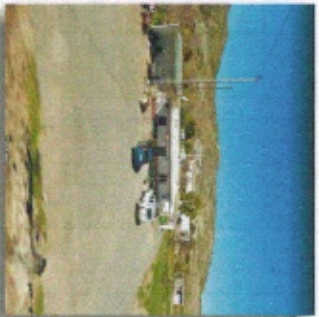
Start Chispers Bar, Nr El Puntal