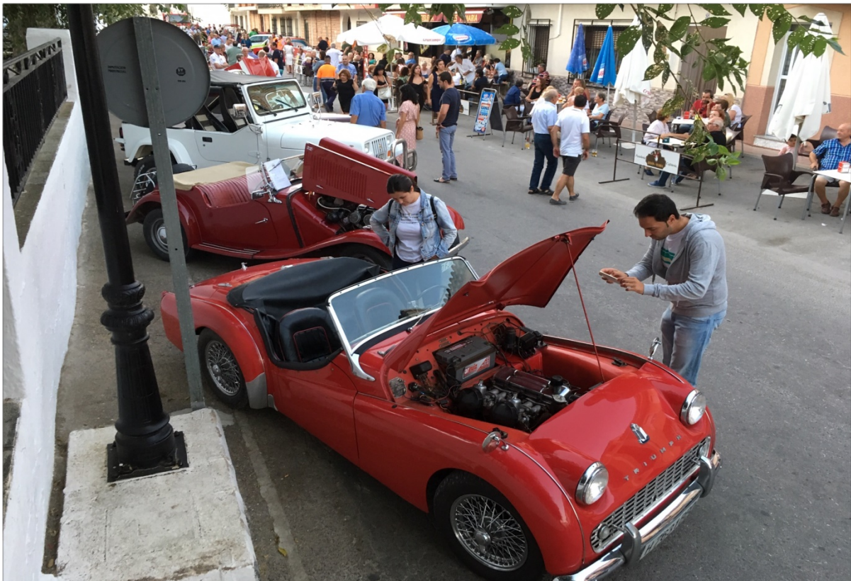
THANK YOU