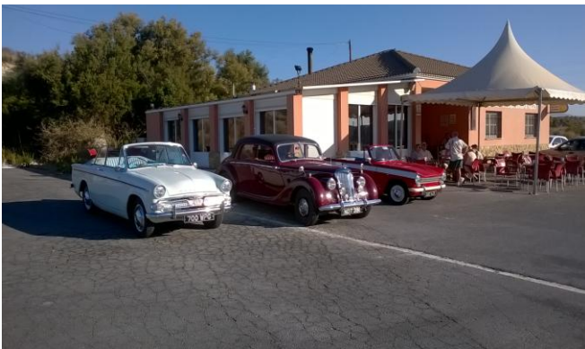
Classics gather at Bar Los Albardines

Friday 19 th August saw the first ‘Spur of the Moment Run’ to Balsa El Cela. Three classics, and seven hardy members turned out and enjoyed the waters, followed by a breakfast and natter in the shade of trees. Some, it was noted, also knocked back a brandy, not that the water was cold, but it provided an excuse!