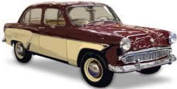
A 1961 407 saloon