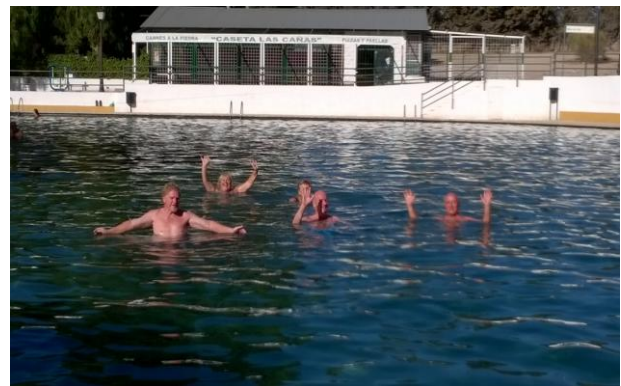
“Come on in, the water’s great”