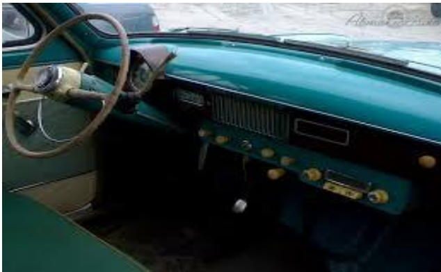
A 'workman like' dashboard