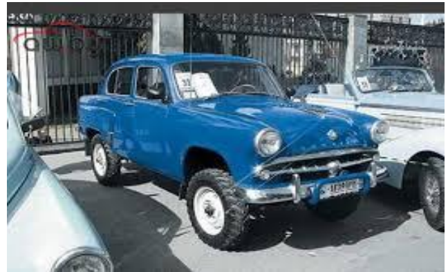
407 all wheel drive