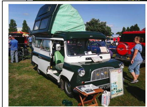
A Bedford CA with a Dormobile conversion, very original and used for holidays