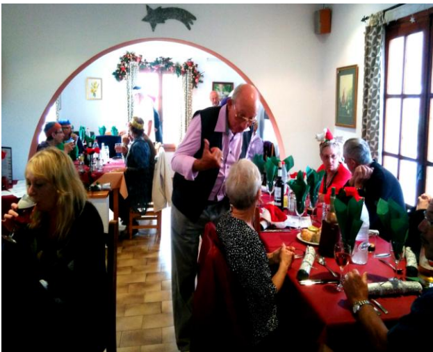
Complete with crackers and novelty hats.