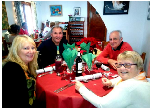
With an efficient seating plan in place, all get comfortable for an excellent meal,