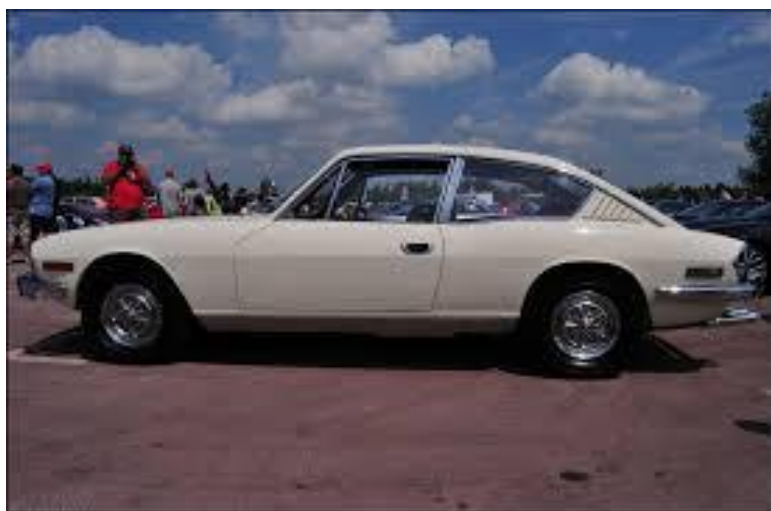
The only surviving fastback Stag

Giovanni Michelotti with his Triumph 2000, which he owned for many years