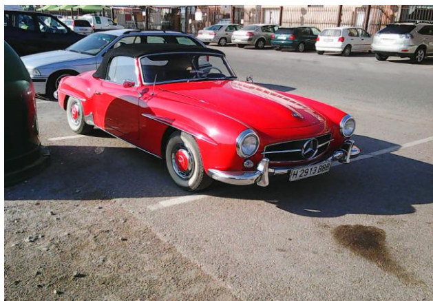
An SL Merc, in good nick too, near Albox.