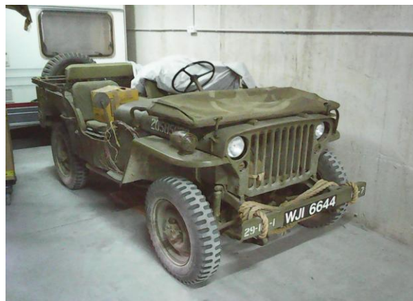
A 1944 Willis Jeep complete with Steve McQueen base ball bat and glove, somewhere near Arboleas. It's for sale. If you are interested, let me know.