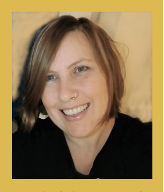
Head of the Centre for Academic Writing (CAW), Coventry University, England