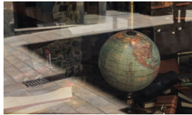
JUNE 5TH OPEN SUMMIT