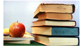
JUNE 7TH PARALLEL SESSIONS