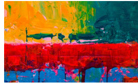
JUNE 6TH PARALLEL SESSIONS