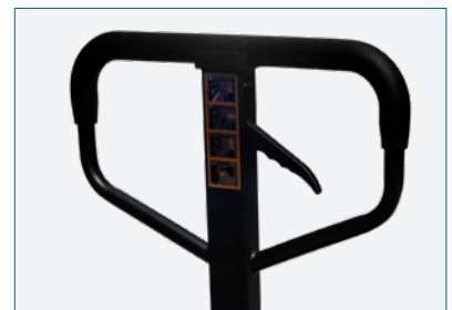
ERGONOMIC HANDLEBAR EASY TO USE

Quality design and finish, with a friendly use. Dust paint for maximum duration. Easy operation with multifunction indicator and LCD display.