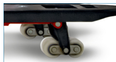
MAXIMUM HEIGHT OF 205 mm