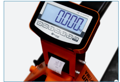
INTEGRATED INDICATOR WITH PROTECTION *Printer version