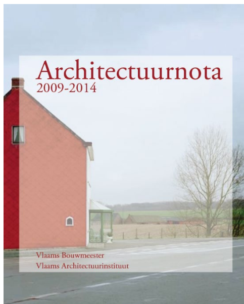
Fig.1 – Joint policy memorandum of the FA and the VAI (2009).

"my architectural policy is (...) in the first place a consciousness-raising policy: inviting people to take a good look at that physical, designed environment, getting them to think about the influence that this has on everyday activities, bringing them into contact with good examples, and convincing them that the choice of good architecture is good not only for themselves but for the whole community." (Ancieux, 2002)