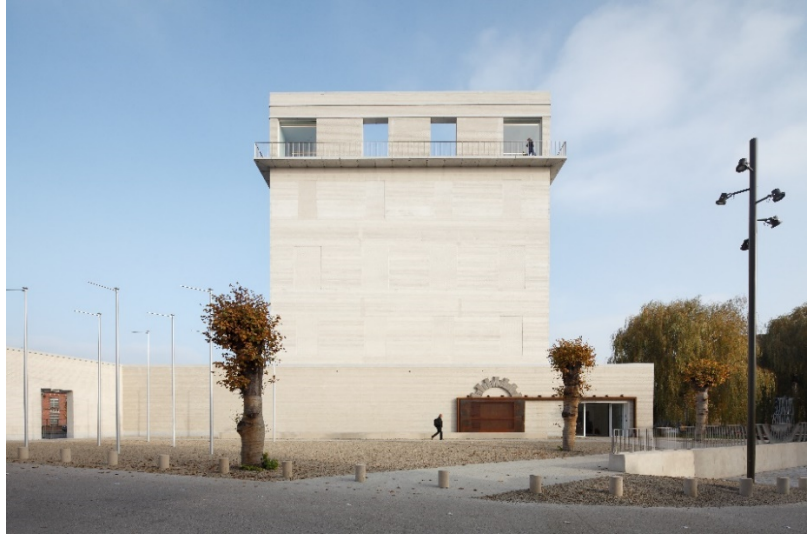
Fig. 11 – Kazerne Dossin Memorial, Museum and Documentation, Centre on Holocaust and Human Rights