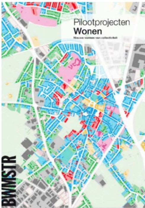
Fig. 7 - Publication of the Pilot Projects 'Collective Living - Phase 1', 2013

follow-up process is planned with the partners to coordinate the development of the master plans and projects (Flanders, 2019).