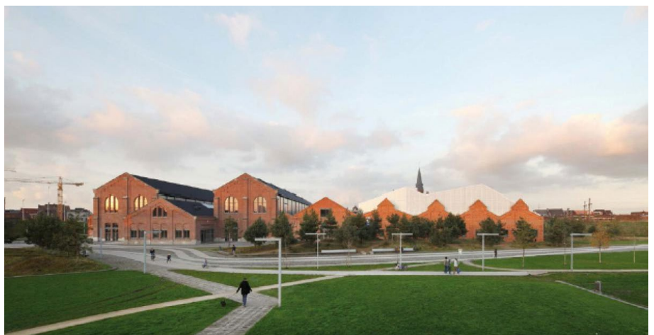
Fig. 5 – Open Call 1202 Parkloods Spoor Noord Antwerp

After the Open Call is concluded and the contract is signed between the designer and the public client, the draft design of the winning proposal will then be fully developed in accordance with the specified terms of the contract. To guarantee the design quality follow-up of the project, the public client can still ask seek further advice and expertise from the FGA or the external jury members.