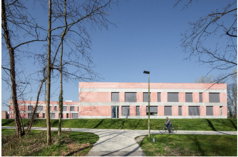
Fig. 12 – Residential care centre Sint-Truiden