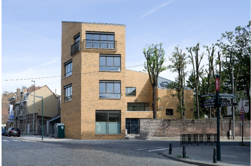
Fig. 9 – Saint Ursula Primary School