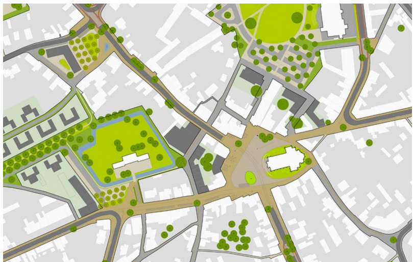
Fig. 13 – Masterplan © BRUT, LAND, Mint, O2 consultation