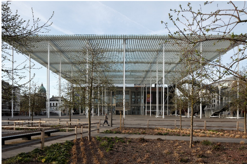
Fig. 10 – Theatre square Antwerp