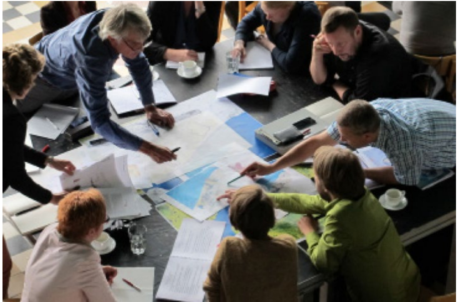
Fig. 8 - Workshop 'Metropolitan Coastal Landscape 2100' /Source: FGA, 2019 © Nik Naudts)

The FGA office (Atelier Bouwmeester) is where the FGA's team operates and where all Open Call juries take place. The Atelier is located in the roundabout of the Ravenstein Gallery in Brussels, a location which prominently makes the spatial policy of the Flemish government and the work and efforts of the Team FGA particularly visible, for both partners and stakeholders and for the general public. Within this space, workshops and public receptions substantively linked to the operation of the FGA Team are regularly organized. The Atelier also includes a gallery for small, limited-duration exhibitions.