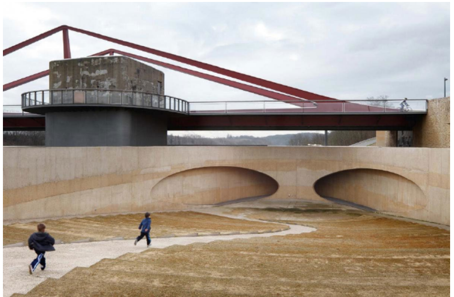
Fig. 4 – Open Call 0229 bridge in Vroenhoven

The Open Call is free of charge for all public and semi-public organizations in Flanders, including regional public services, city and municipal authorities, as well as housing agencies, non-profit organizations in the care sector, etc. (Liefoghe & Van Den Driessche, 2019). According to the former FGA (Van Broeck, interview: 2018), in general, half of the commissions originate from small local authorities, usually medium-to-large-sized districts, and the other half from the Flemish government.