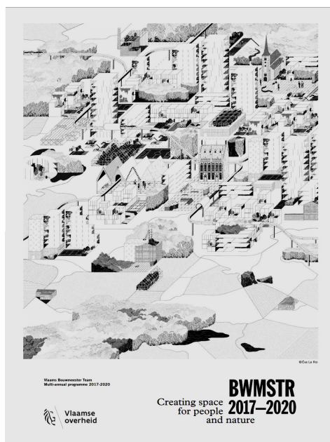
Fig. 2 – FGA multi-year program for the 2017-2020 period.

At beginning of their mandate, the FGA defines a job profile for the members of the expert group and an open call is launched by the government. After the selection process, alongside the advice of the FGA, the group of experts is nominated by the Flemish government. Its members do not receive the status of being a civil servant and are remunerated from the operating resources of the FGA.