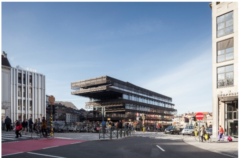
Fig. 14 – Waalse Krook Media Library in Ghent