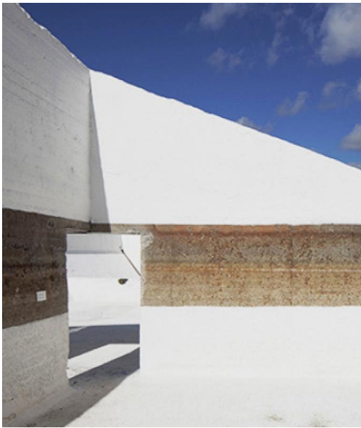
Fig. 6 – 'Gravel bins' installation in Ghent by ROTOR