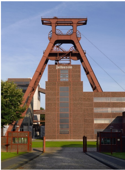
The IBA Emscher Park aimed to provide an impetus for economic change in the Ruhr region using new urban, social, cultural and ecological ideas, preserving and reusing industrial culture, and implementing projects such as the Zollverein Coal Mine Industrial Complex.

Simultaneously, the intervals between each IBA have shortened and, for the first time, several IBA have been run in parallel – two in Eastern Germany and one in Western Germany: The IBA Fürst-Pückler-Land (2000-2010) induced a new interpretation and transformation of the mostly rural post-mining environments of the Lausitz region, while at the same time the IBA Stadtumbau (Urban Renewal) in Saxony-Anhalt (2002-2010) focused on shrinking small and medium-sized cities and was the first IBA to span across an entire state. Simultaneously, the IBA Hamburg (2006-2013) focused on urban development to connect the disfavoured parts south of the Elbe River with the city centre. 11 Currently, six IBA have taken place, and more initiatives have emerged – among them the idea of an IBA Africa supported by the German Agency for International Cooperation (GIZ).