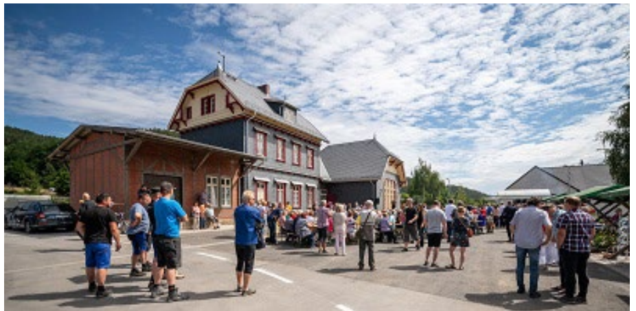
Abandoned train stations have become a typical sight in rural regions. As a project of IBA Thuringia, the former station in Rottenbach was revitalized and redesigned as a transport hub for buses, trains, cars and bicycles.

Furthermore, going beyond the material dimension of buildings, the newest IBA generation focuses particularly on innovations in processes. Thus, the thematic and conceptual emphases of some IBA and IBA projects have shifted from the mere production of space to the more abstract and complex appropriation of space. As ALTROCK (2011) states, IBA have evolved from building shows as exhibitions of “space-production” to “exhibitions of space-practices” 14 . Thus, temporary and performative dimensions through the involvement of artists or scenographers, or the staging of concrete places and their (re)interpretation, now constitute the conceptual core of many IBA projects. For instance, the projects of the IBA Thuringia, with its focus on urban-rural relations spanning across the whole state, mainly focus on the temporary and performative appropriation, reuse, and relabelling of vacant places. 15 For instance, through civic engagement, an unused train station was transformed into a flexible space used both for a grocery store offering regional products, and as a meeting space. In the project proposal “Summer retreat Schwarza Valley”, a landscape which has offered an escape for urban dwellers since the 19 th century, visitors can now get to know impressive yet derelict former vacation estates, indulge in the scenery and witness the successive activation of the landscape.