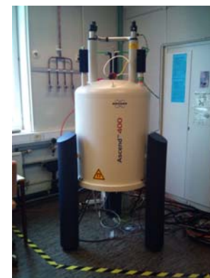
Bruker Avance III AQS @ 9.4 T