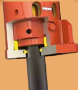
DUST PROTECTION RING