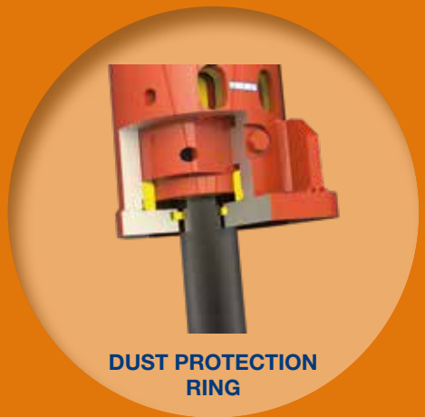
DUST PROTECTION RING