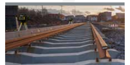
HORIZONTAL, INVISIBLE & FULL AUTOMATIC DUAL GRADE WITH DIAL-IN AND MACHINE COMPATIBILITY