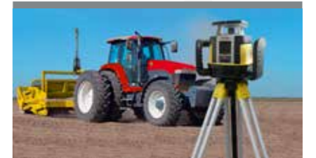
HORIZONTAL, INVISIBLE & FULL AUTOMATIC DUAL GRADE WITH DIAL-IN AND MACHINE COMPATIBILITY