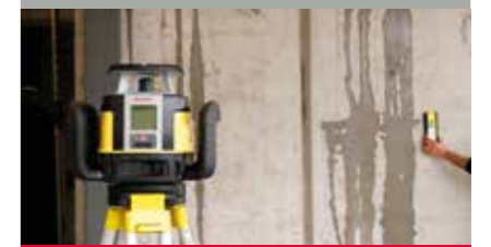
HORIZONTAL ONE-BUTTON LASER