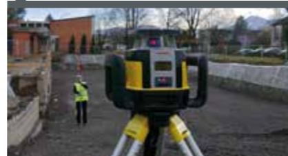
GRADE WITH DIAL-IN