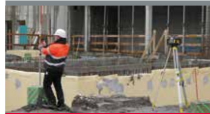
HORIZONTAL & SLOPE