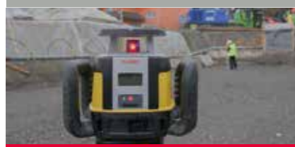
HORIZONTAL ONE-BUTTON LASER