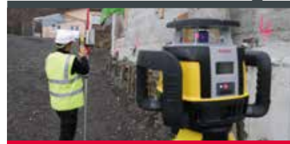
HORIZONTAL & SINGLE GRADE WITH DIAL-IN