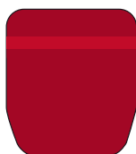
Delta-shaped plate Hardox 400 quality