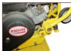
System to reduce HAV (Hand-Arm Vibration)