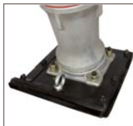
Wood laminated foot