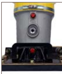
Oil level gauge