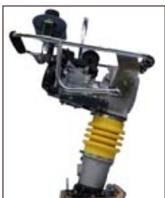
Perfectly balanced rammer with high stroke