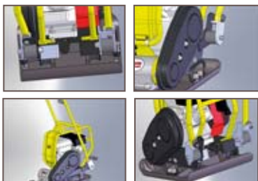
Perfectly balanced and designed for the toughest job sites.