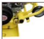
Low HAV mechanism