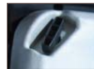
Manual dual starter