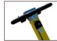
Low HAV handle with rubber mounts and servo control