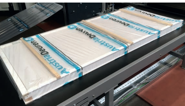
The tubular stretch film is printable and suitable for branding and product information.

One of the main advantages of RoRo StretchPack® is the reduction of film consumption compared to heat shrink and wrapping. We have seen reductions in film consumption between 25-60%. In addition, if you replace a heat shrink packaging line, you will also see reductions up to 90% in your energy consumption.