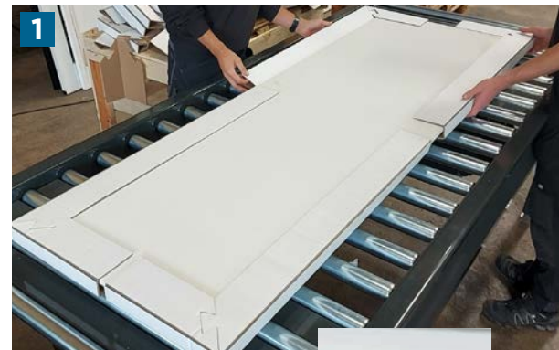
The door is lifted up from the roll conveyor for mounting of corner protection.