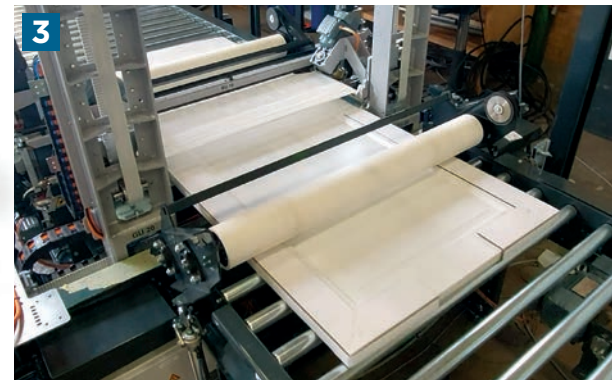
Utilizing RoRo StretchPack® the door is packed into a tubular stretch film. The tubular film is sealed in both ends during the packaging to ensure 100% sealing.