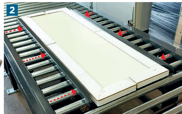
Before packaging the door is centred. The width and height are measured while the door is centred. The measurement is used to prepare the right film size for packaging.