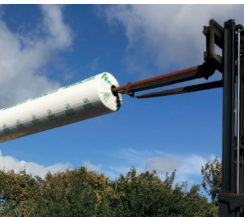
A plug at the ends of the rolls is option

One of the advantages of stretch hood packaging is the reduced film consumption and the minimum of the waste film during packaging. For the end-users, this means less disposal waste. A reduction in film consumption will reduce your total film costs.