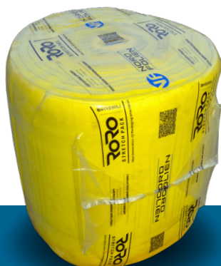
RoRo StretchPack® can pack rolls as "eye-to-sky" or "eye-to-wall"

The tight packaging and smooth surface of the film make it easy to handle the rolls without damages. The strong sealing also ensures that you can stack up rolls outdoor without the risk of penetration of water.