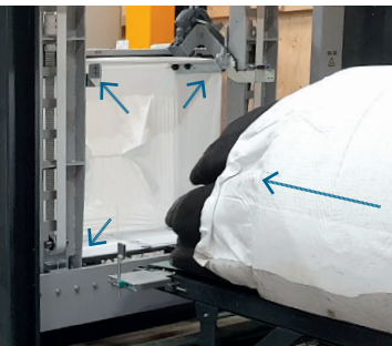
The stretch hood packaging process