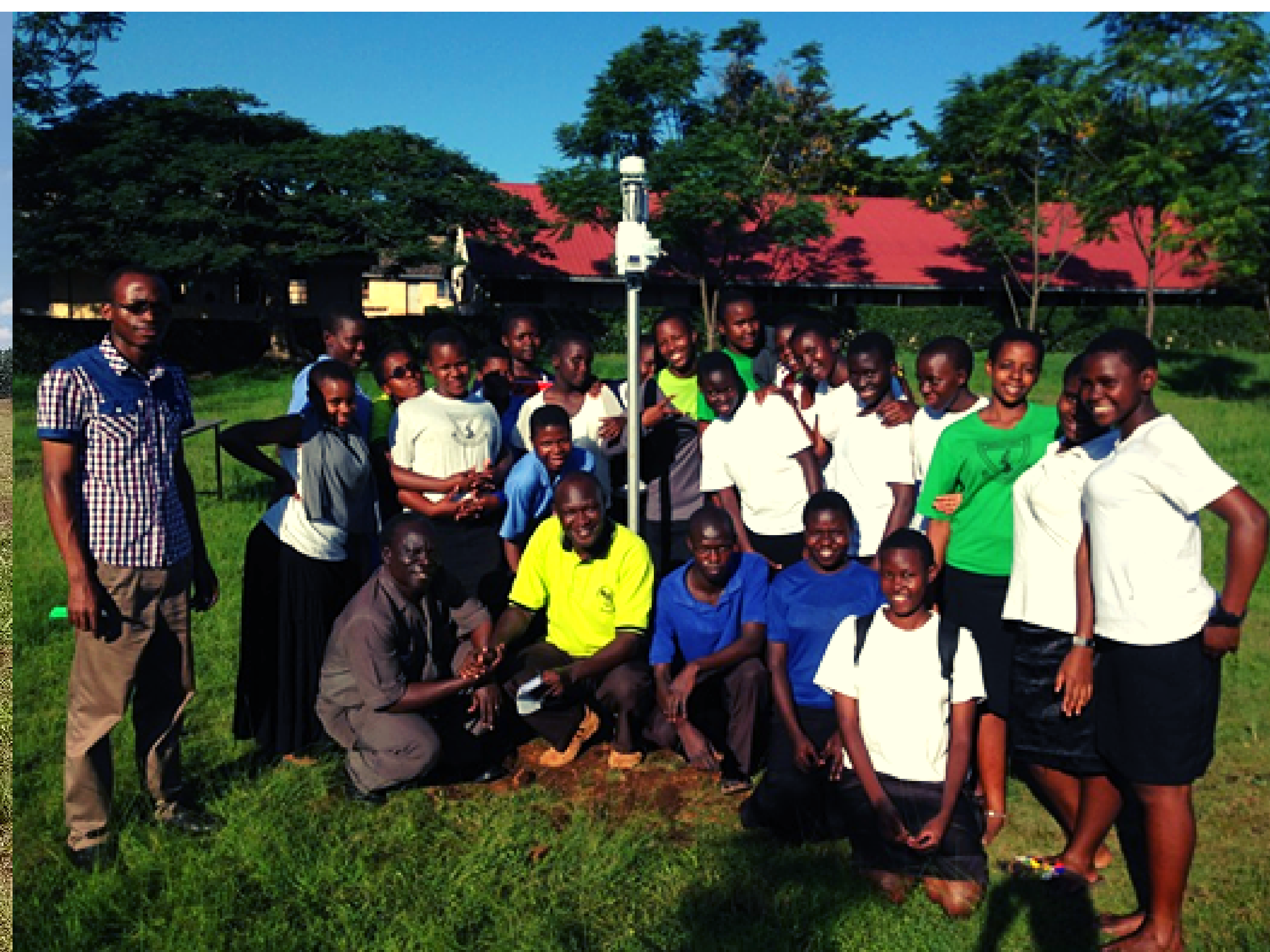
Education for students