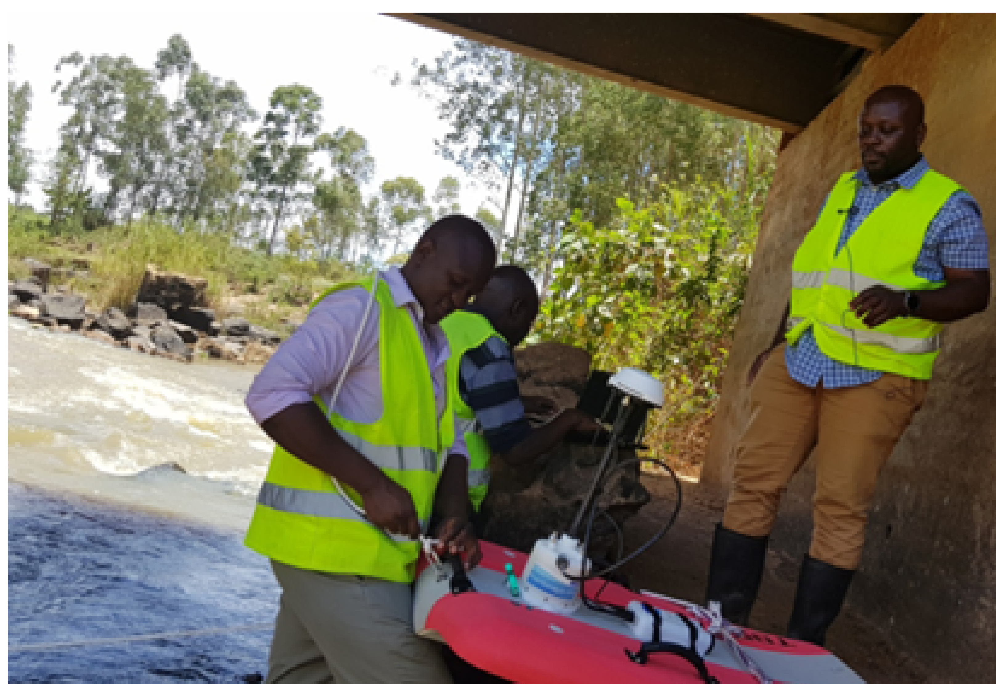
Training for NMHS