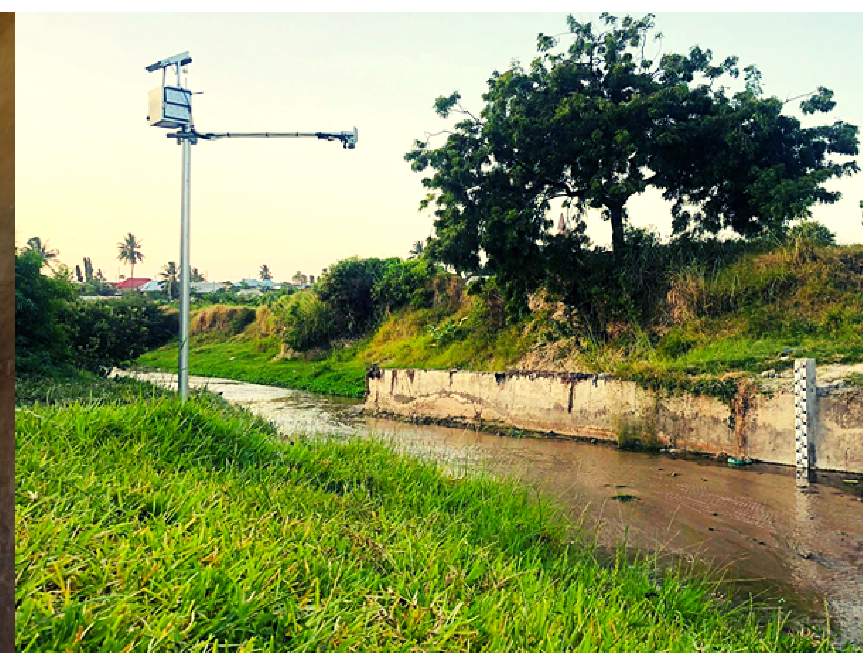
TAHMO-RS Hydrological Station