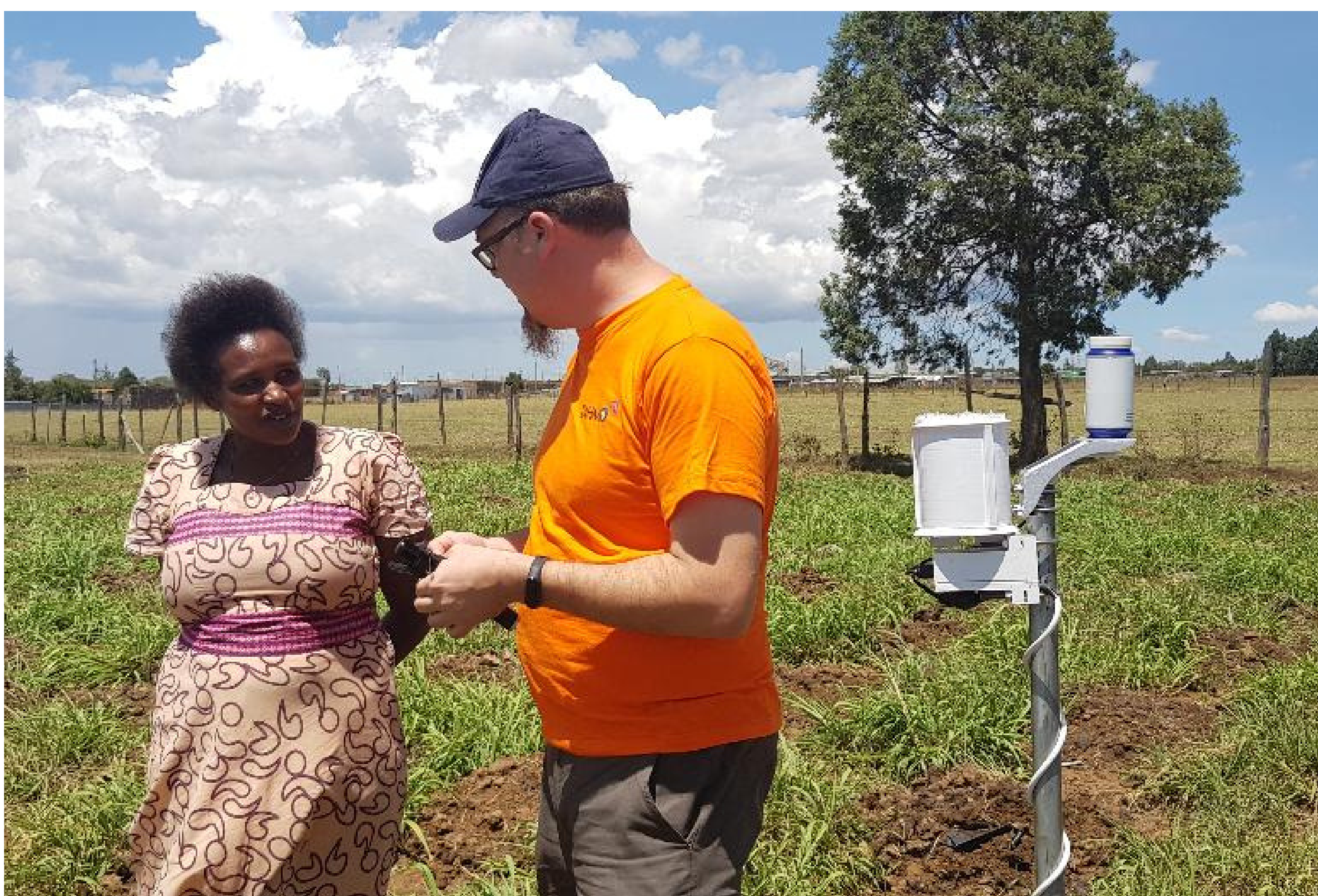
Services for farmers

The idea behind the TAHMO initiative is to develop a dense network of hydro-meteorological monitoring stations in sub-Saharan Africa – one every 30 km. This entails the installation of 20,000 stations across the continent.