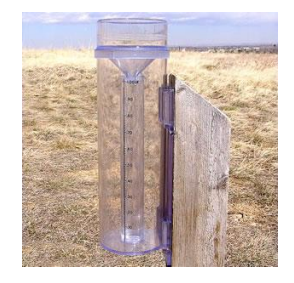
Figure 1: Rain gauge/Cylindrical container

The Hall sensor interacts with the field of a magnet and induces a voltage as a result. It is attached to the base of the cylindrical container, and the entire container is positioned in such a way as to enable the sensor interact with a magnetic field in an enclosure. Therefore, with the new masses due to water being collected, voltages are induced in the sensor. The induced voltage, which is fed into a microprocessor, then has to be calibrated experimentally according to the changes in mass due to water.