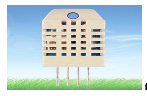
fig.iv: shown RHT03 and Lm35 sensor

e. Relative humidity, Wet and dry bulb temperature sensors using RHT03 and Lm35: