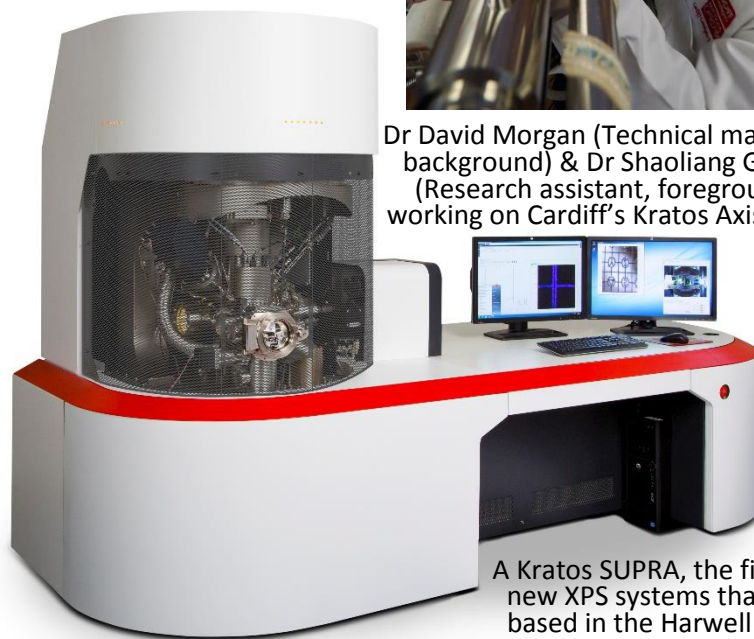
A Kratos SUPRA, the first of the new XPS systems that will be based in the Harwell campus