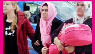
A woman who had just delivered a baby dragged to police detention in a pain and agony with newborn baby on grandmother's arms.