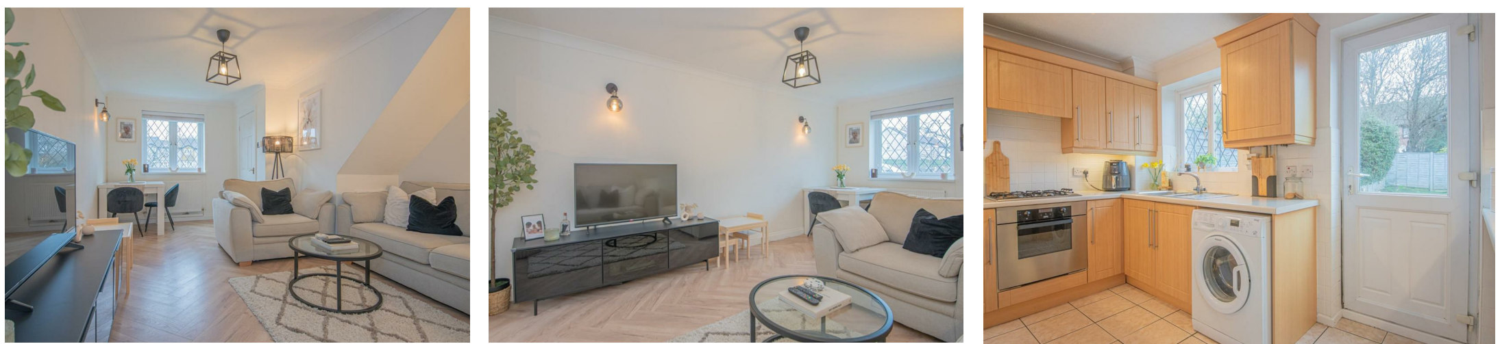
GROUND FLOOR 430 sq.ft. (39.9 sq.m.) approx.