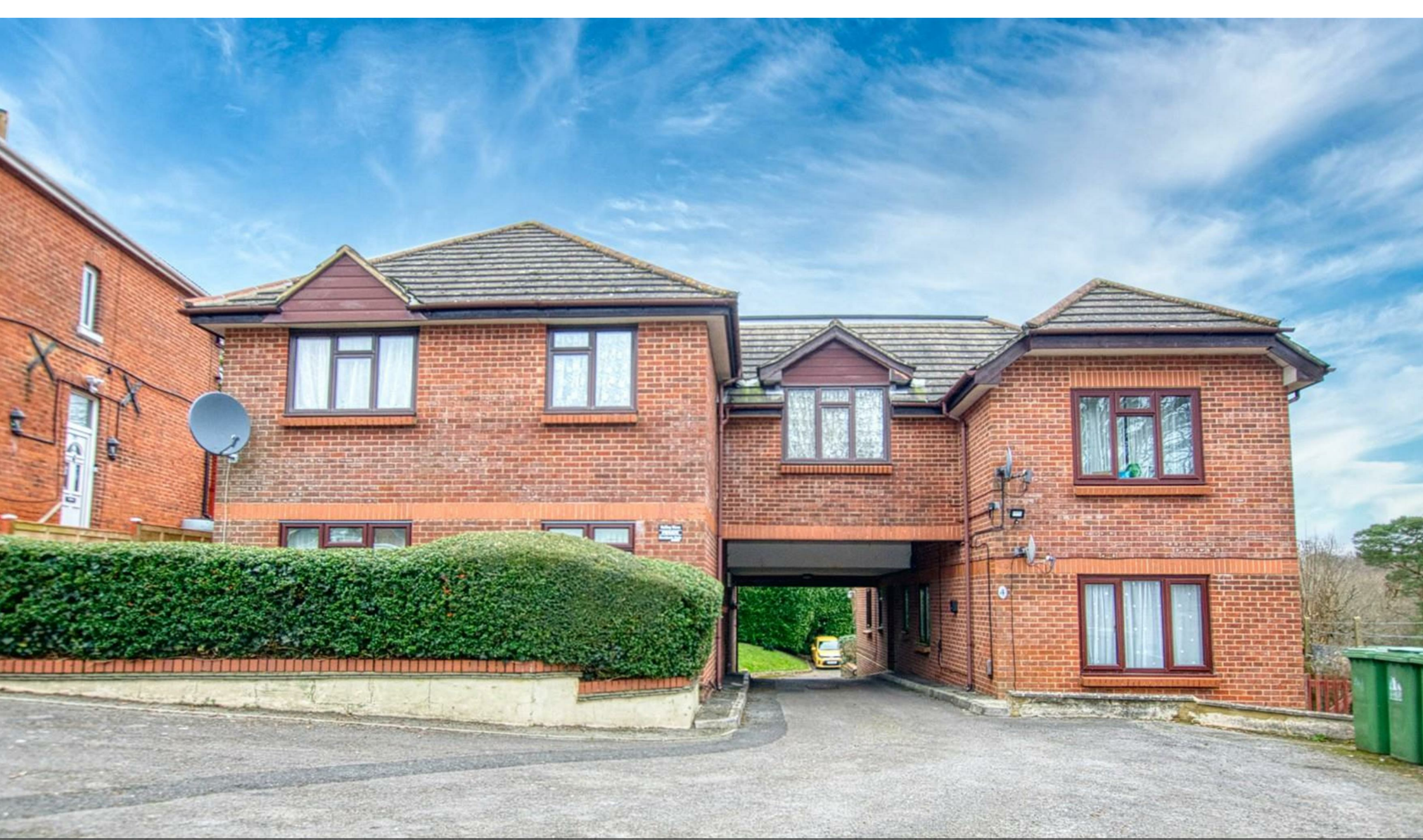
Valley View, Furze Road - £170,000