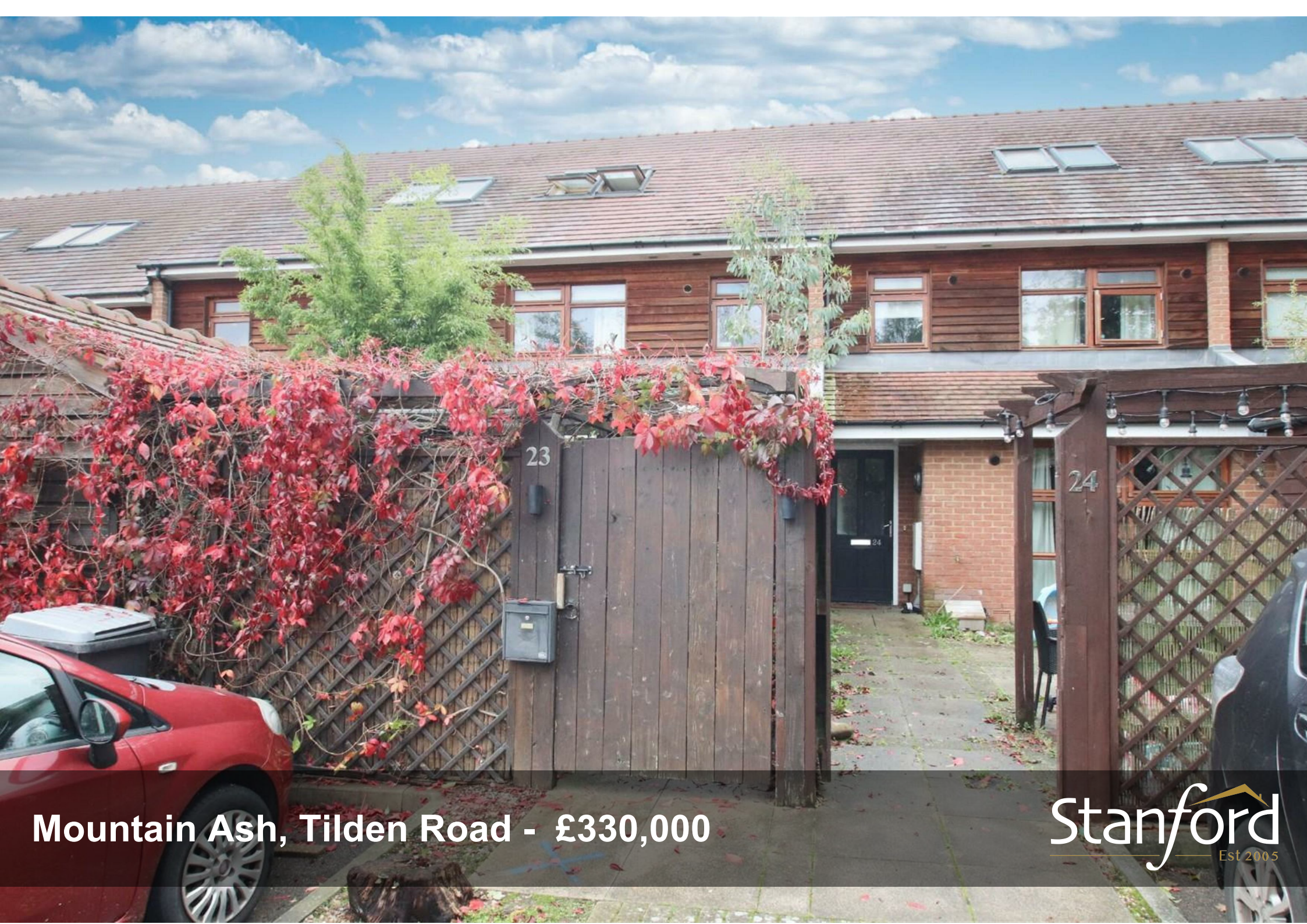
Mountain Ash, Tilden Road - £330,000