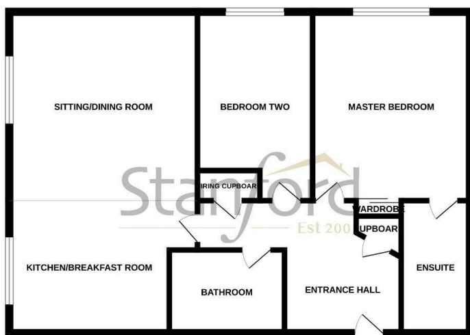
LORDSDALE COURT SEACOLE GARDENS, SHIRLEY

While every effort has been made to ensure the accuracy of the description contained here, measurements of floors, ceilings, walls and any other items are approximate and no responsibility is taken for any error, omission or misstatement. This plan is for illustrative purposes only and should be used as such by any prospective purchaser. The services, systems and appliances shown hereon have been tested and no guarantee is given in relation to their performance or condition. Made with Metrepro (2022) by Stan.