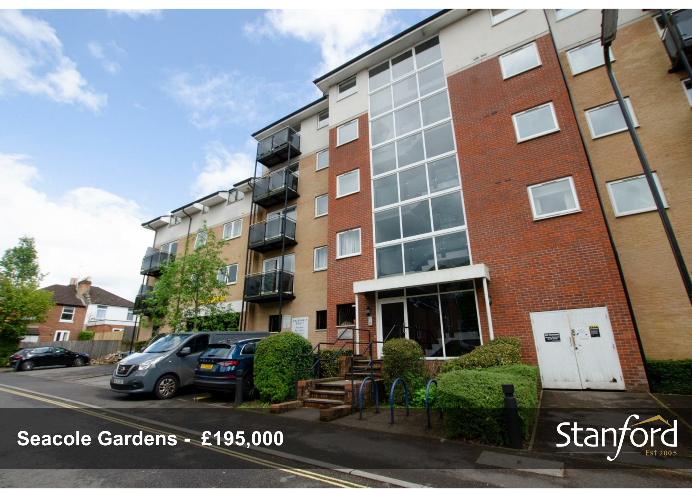
Seacole Gardens - £195,000