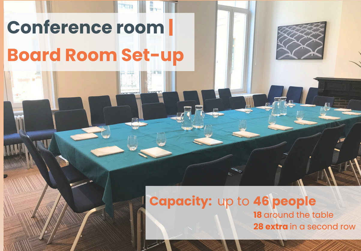
Conference room | Board Room Set-up