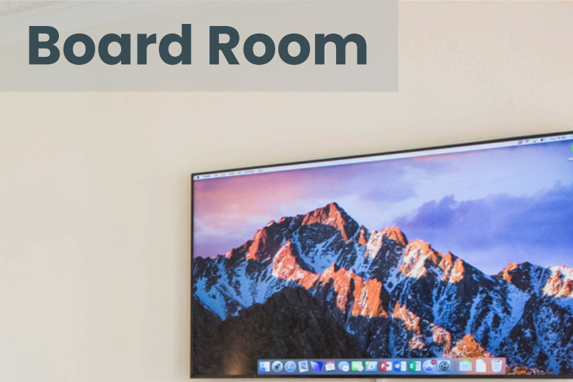
Board Room capacity: up to 12 people