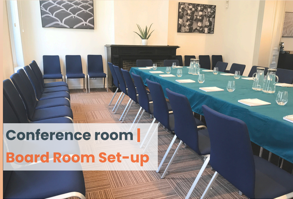
Conference room | Board Room Set-up