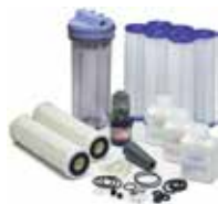
Preventative Maintenance Kit