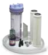
Silt Reduction Kit

For waters with high levels of suspended matter, e.g. in shallow anchorage, we would recommend you use an additional prefilter. This additional filter is finer (5 microns - 1 micron = 0.001 mm) than the standard filter (30 microns) and is placed after it. A booster water pump (12V/0.8 A/h) is also provided. This pump compensates for the loss through the second filter and increases water production. We would also recommend the prefilter kit when the PowerSurvivor is not installed under the water line and when it is in constant use to increase the intervals between servicing.