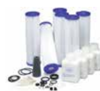
Extended Cruise Kit

Spectra reserves the right to modify products